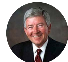
MAYOR GARY FULLER